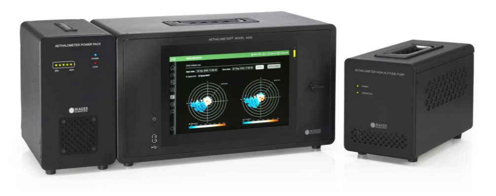
Figure 3: Magee Scientific Aethalometer® model AE43 with battery supply and external booster pump for high-altitude operation

Virkkula A., 2010, Correction of the Calibration of the 3-wavelength Particle Soot Absorption Photometer ( 3\lambda PSAP), Aerosol Sci. Tech., 44, 706-712.